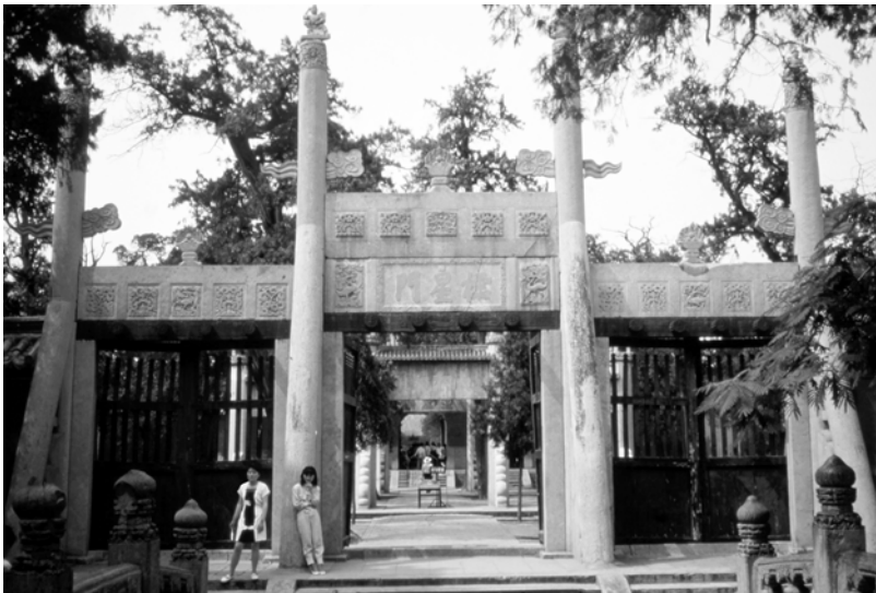
Entrance to the temple of Confucius and his tomb located in his hometown, Qufu.

Birth rites reflect the union of yin and yang and the production of an heir, if the child is male. Celebrations occur on the third,